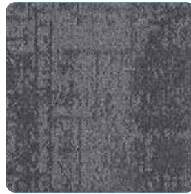
1330 STERLING ASH