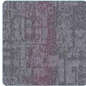
1313 PERIWINKLE FOIL