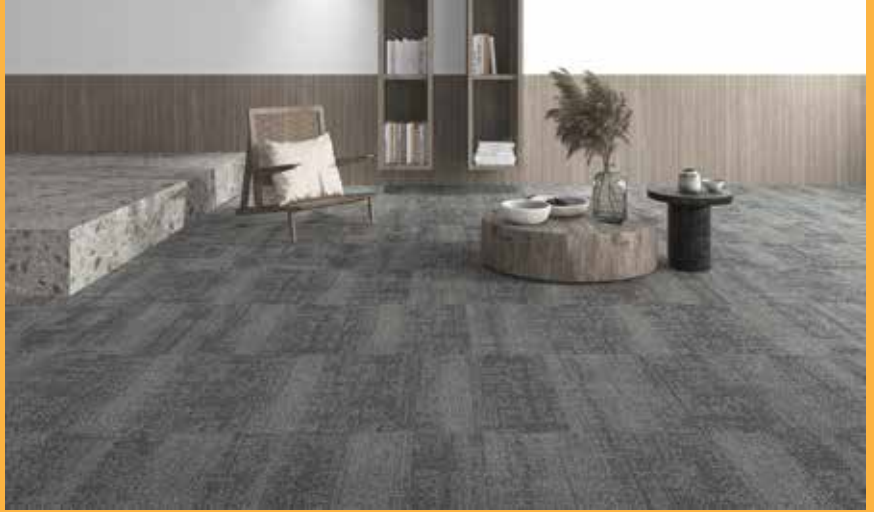
1330 STERLING ASH ⓘ