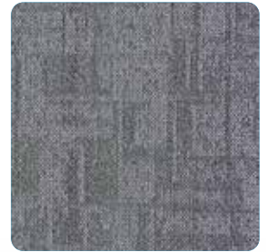
1315 BISMUTH GREEN