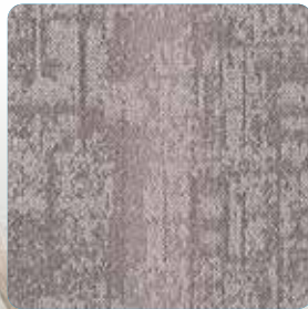
1370 GAINSBORO BEIGE