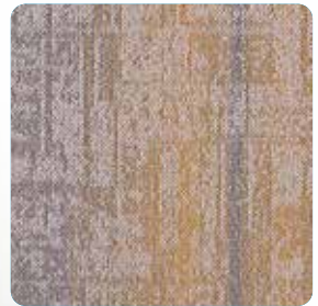
1377 GAMBOGE YELLOW