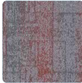
1314 VERMILION VEIN