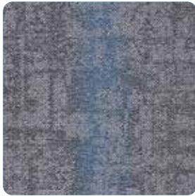
1312 AZUREAN BLUE