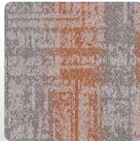
1376 RUSSET ALLOY