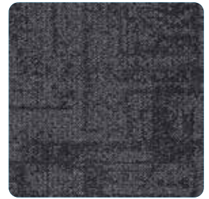
1340 ONYX CINDER