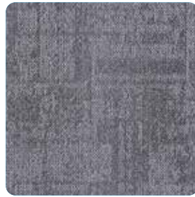
1310 CHROMA GREY

In Tile size 50cm x 50cm Tile pattern are packed randomly per box.